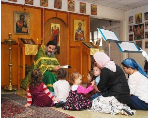
A homily at a children's liturgy

Rain... Rain... Rain... We continued to pray our Moliebans and Liturgies, including our twice-monthly children's liturgy.